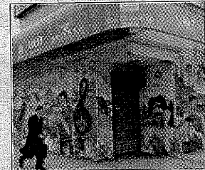
J&N Records, on 10th Avenue, is a wholesale record store.

Metro Baptist Church [at 410 West 40th St.]. If you take the bus to the Port Authority, it's the last place