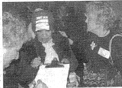
Signing the visitors book at Speaker Silver’s office.